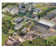
William Grant Tullamore, Co. Offaly