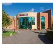
Ul Sport Arena Limerick