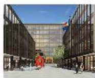
Miesian Plaza Dublin