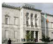
National Gallery Dublin