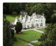
Hotel Lough Rynn Castle Mohill, Leitrim

Unit 74 Dunboyne Business Park, Dunboyne, Co. Meath www.eicl.ie • Tel: +353 (0) 1 8255155 • aircon@eicl.ie