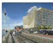
Central Bank Dublin