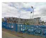
Dawn Food Naas, Co. Kildare