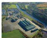
Holfeld plastics Arklow, Co. Wicklow