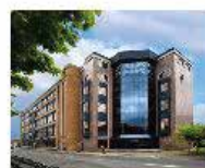
Treasury Building Dublin