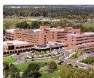
Beaumont Hospital Dublin